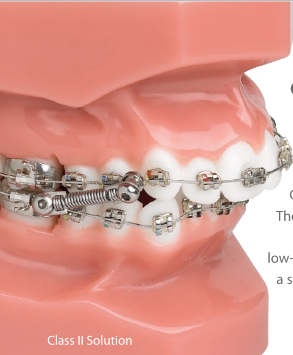
Class II Solution