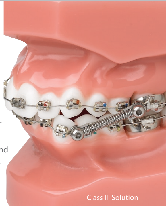
Class III Solution

This revolutionary system will guarantee results with your Class II and Class III orthodontic cases. The CS-2000 ® Niti springs are a DynaFlex ® exclusive, utilizing a patented, low-continuous force, closed coil spring and a specially built "key-hole" end which fits over a patented slotted base pivot similar to a Herbst ® housing nut.