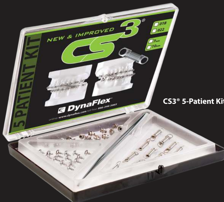
CS 3 ® 5-Patient Kit

The all new CS 3 ® is made from an exclusive nickel titanium material that has amazing features and far surpasses other spring systems including our popular CS-2000®. Although the CS-2000® is extremely successful, we wanted to make it even better and that's exactly what we did. The new CS 3 ® spring will load force instantly and remain extremely consistent throughout treatment. The benefit is a smoother, more constant force that performs better and lasts longer. The CS 3 ® system is one of the most successful Class II and Class III chairside appliances used in the world due to its simplicity, effectiveness and value pricing as compared to other systems available today. Now the CS 3 ® is a major improvement on an already successful and widely used product. This is a must have system for your orthodontic tool box.